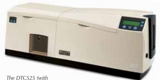
The DTC525 (with optional Lamination Module) is ideal for high-volume applications or demanding environments.