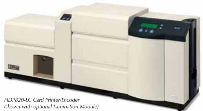
HDP820-LC Card Printer/Encoder (shown with optional Lamination Module) is ideal for oversized cards used in government, military, university or event applications.