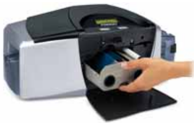
Print both sides of your cards faster and more accurately with the optional Dual-sided Printing Module.

No other printer/encoder is as easy to use and so secure at the same time. The compact DTC400 is an affordable solution for organizations who demand it all: reliable, intuitive operation with minimal training and maintenance. Say goodbye to taped ribbons and cumbersome card cleaners thanks to Fargo's SmartLoad™ Ribbon Cartridge. The DTC400 offers unheard of versatility and security in a card printer/encoder. Plus, the next-generation DTC400 is protected by SecureMark Technology. It also offers field-upgradeable modules for dual-sided card printing, mag stripe cards and/or technology cards.