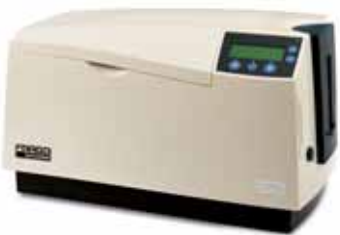
Single-sided DTC515 Card Printer/Encoder

The heavy-duty construction of the DTC500 Series makes it ideal for high volume card printing and encoding. Plus, if your cards are exposed to demanding environments or conditions, you can add an additional layer of durability and security with an optional Lamination Module.