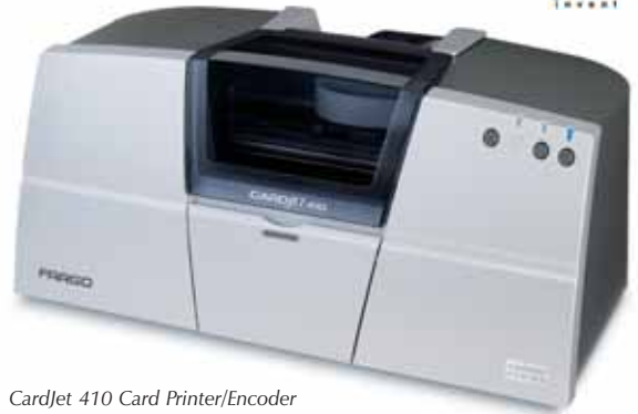
CardJet 410 Card Printer/Encoder is ideal for small corporations, K-12 schools, retail, loyalty and membership applications.