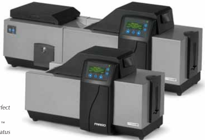
HDP600 Card Printer/Encoder (shown with and without optional Lamination Module) is ideal for technology cards used in government, military, university or high-security corporate applications.

THE NEXT GENERATION | OF FARGO INNOVATION