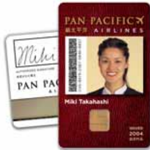
The HDP600 is ideal for printing, encoding and laminating technology cards.

Reliable, secure and smart; the Fargo HDP600 is ideal for printing, encoding and laminating technology cards with embedded electronics. Featuring Fargo's patented High Definition Printing™ (HDP) Technology, the HDP600 is able to print over surface irregularities, including internal RFID antennae, integrated circuits and electronic smart chips, without damaging the card's electronics or the print heads. With optional encoding and lamination modules, there's simply no better choice for high-security cards.