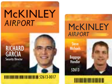
Oversized CR-100 card Standard CR-80 card

Print oversized cards for events and applications where detail is mandatory and visibility at a distance is necessary.