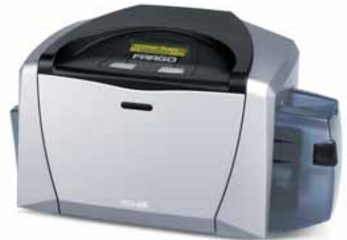
DTC400 Card Printer/Encoder is ideal for medium- to large-sized corporations, loyalty, K-12 schools and state and local government applications.